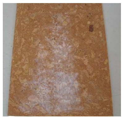
6. Wait until both adhesive films are completely dry and transparent.