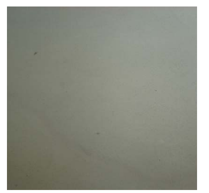
1. Start with a smooth level and dust free cement based subfloor.