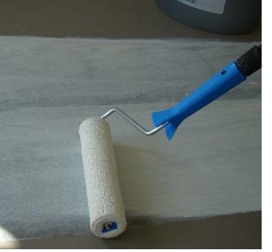
5. Apply a thin layer of adhesive to the subfloor. Ensure full coverage but avoid adhesive puddles.