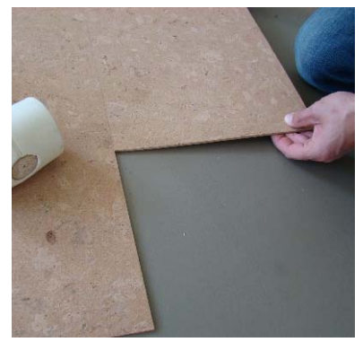
8. Install further cork tiles by using a rubber mallet.

The variety of materials used and the different construction site conditions, which be beyond our control, preclude any claims based on this data. We therefore recommend making sufficient trails. Accompanying recommendations and regulations, flooring manufacturer's instructions and the current applicable codes must be observed. Please observe our usage advice in the Technical Information of our products. We gladly provide technical advice and written installing recommendations for concrete job sites. This recommendation supersedes all previous versions.