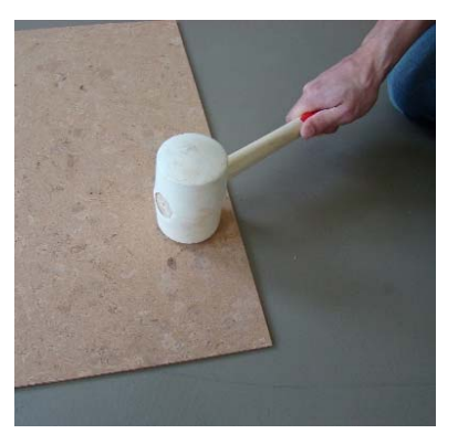
7. Install cork tiles by using a rubber mallet to ensure a proper bond between the two adhesive layers.