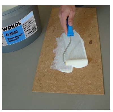
2. Apply adhesive with a short-nap roller on cork backing.