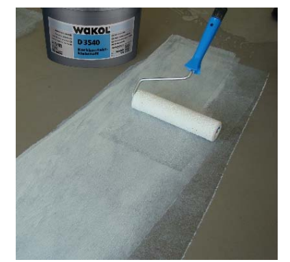
4. Apply adhesive with short-nap roller on the subfloor.